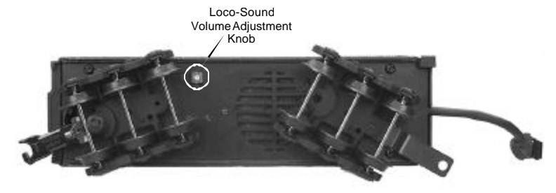
Figure 1. Loco-Sound Volume Adjustment Knob

Volume Control – To adjust the volume of all sounds made by this engine, turn the master volume control knob located under the tender clockwise to increase the volume and counter-clockwise to decrease the volume (see Fig. 1).